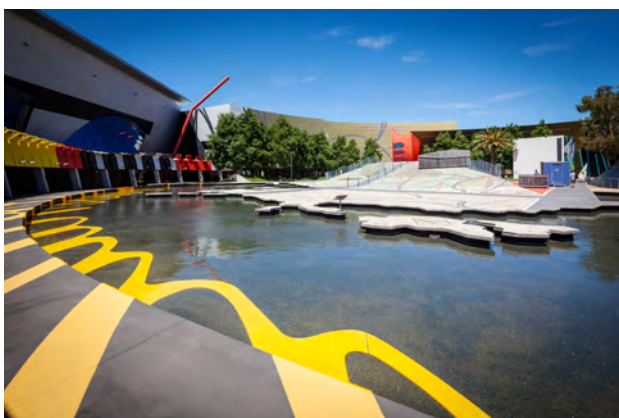
Garden of Australian Dreams